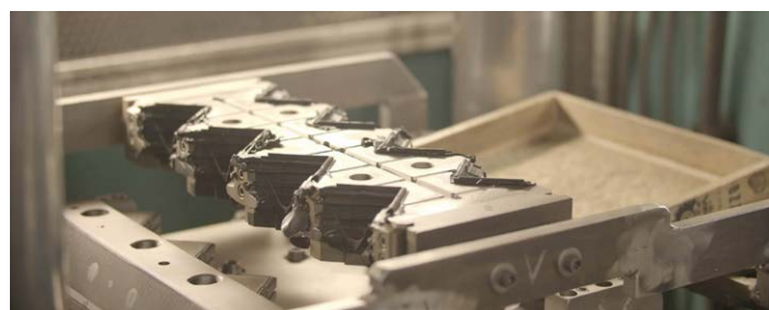
Production from a molding tool with 8 cavities

In development, material selection, and production, REIFF values achieving and maintaining maximum levels of quality. Productions at the in-house machine park in Erbach can be prioritized for customers requesting larger quantities, in addition to reserving machine capacities. If required, REIFF delivers several times a week. Customer-specific packaging such as cardboard boxes and foil bags with customer logos and customer-specific label printing can be realized, and entire assemblies can be combined and shipped. " We support our customers throughout the entire value chain, from the development to the design, production, packaging and delivery of the goods - that is our benchmark," states Jonas Kipphan, Head of Industry Sales and Key Account Management at REIFF.