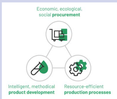
Caption - graphics magic triangle: We are guided by the "magic triangle" consisting of the variables procurement, product development and production processes.

"As engineers, we at JÄGER approach the challenge very analytically - we are guided by the "magic triangle" consisting of the variables procurement, product development and production processes."