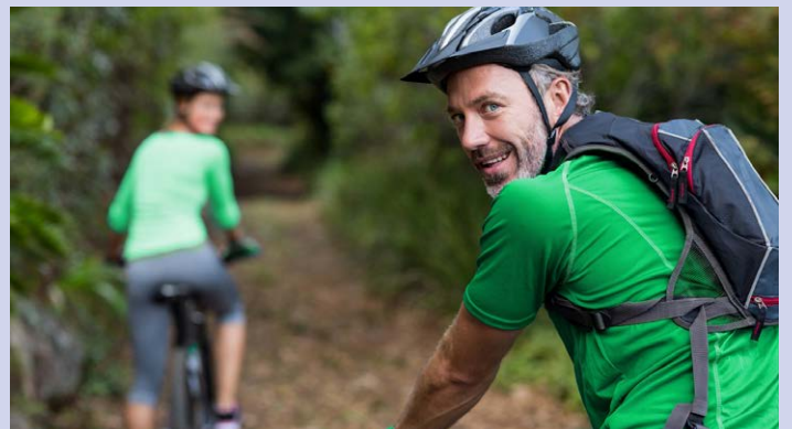
Caption - Job bycycle: Via JobRad we offer the possibility to lease bicycles of all kinds at a reasonable price. Simply save money and cycle to work in a fit and environmentally friendly way.

JÄGER offers its employees an attractive mobility package: bicycle leasing with JobRad. Whether city bike, cargo bike or electric bike - employees can easily purchase their desired bike at attractive conditions through the company.